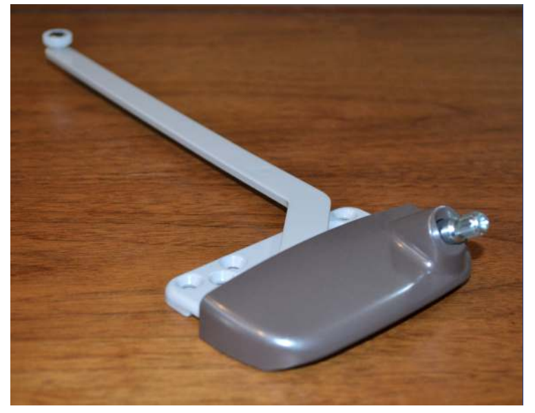
Old Style - The older style operator has one arm and does not have a crank cover. *Note: current version has rounded edges and may visually differ from your existing operator.*

Determining which style operator you need: